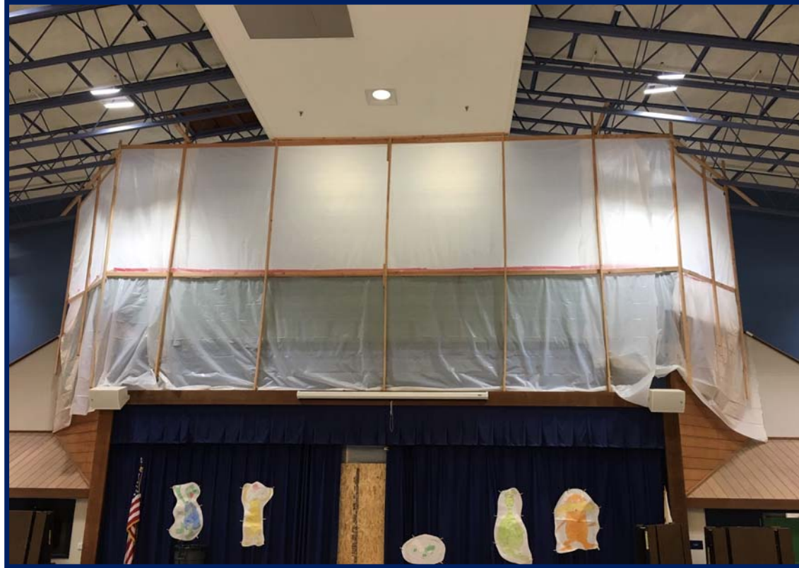
Cherrywood FIS – Looking Up at FIS - March