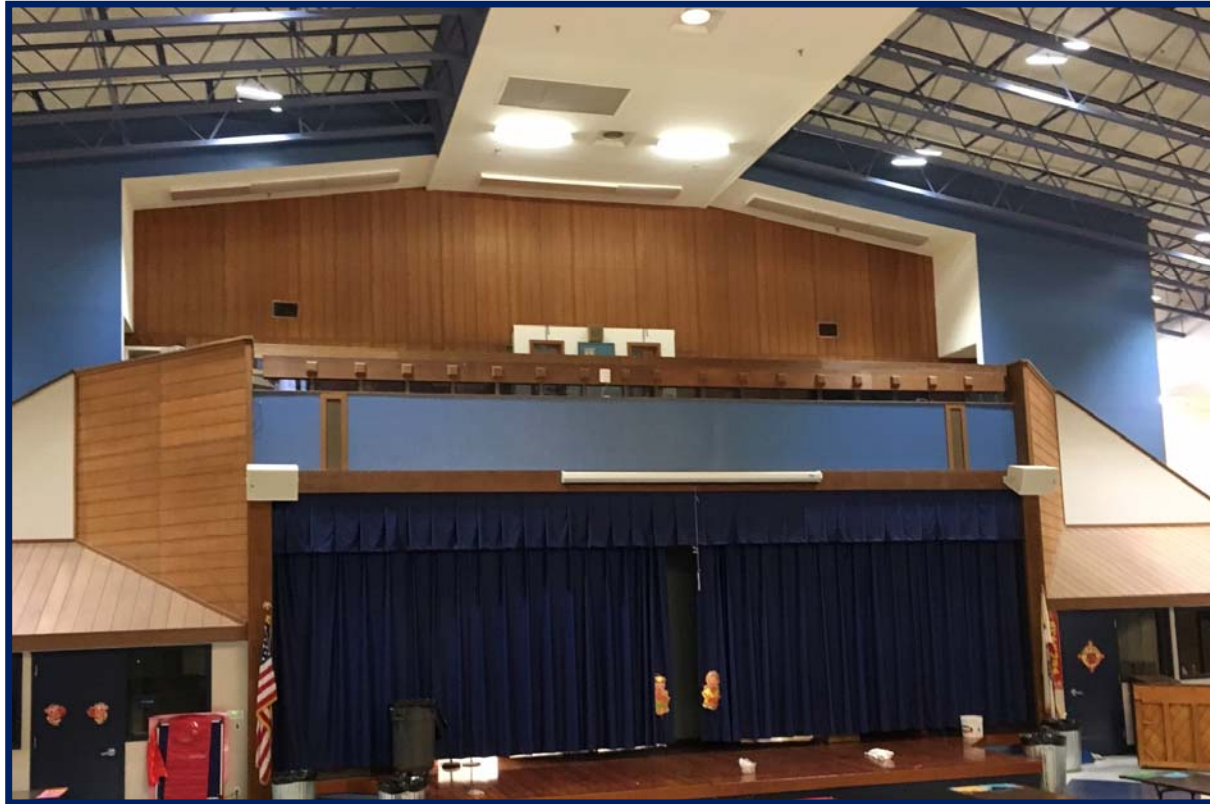
Cherrywood FIS – Looking Up at FIS -February