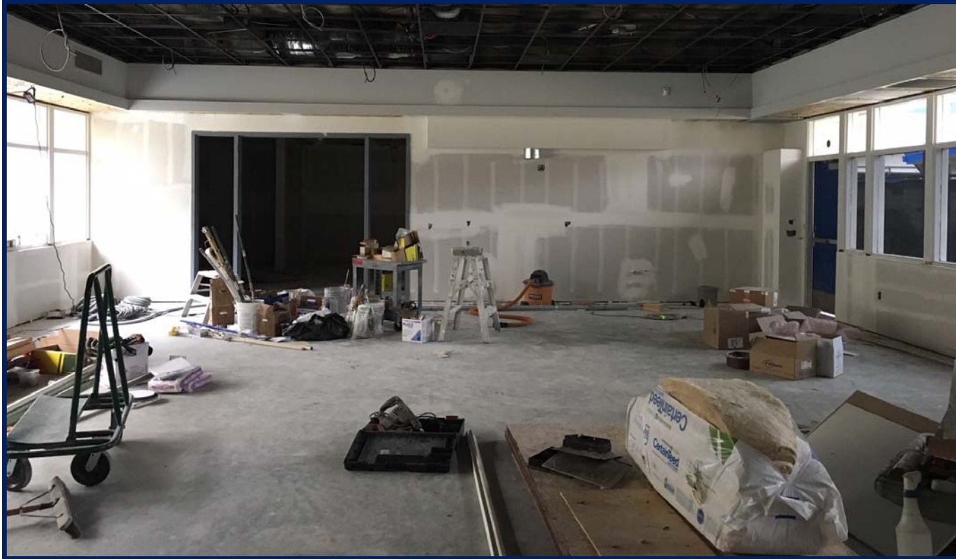
Toyon FIS – Looking West - March