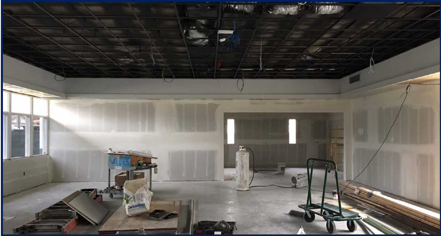
Toyon FIS – Looking East - March