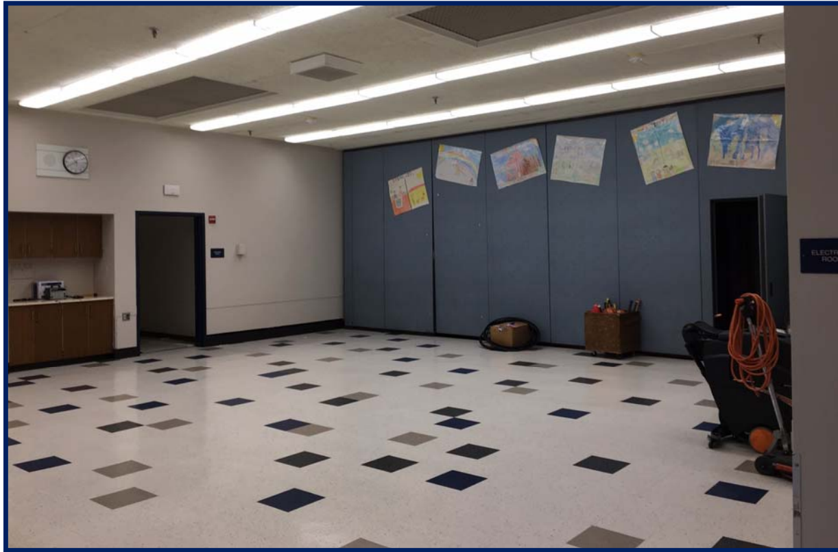
Cherrywood FIS – Kitchen Area - February