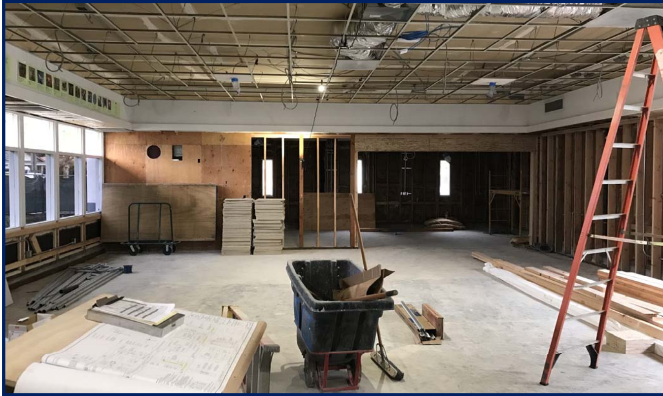
Toyon FIS – Looking East - February