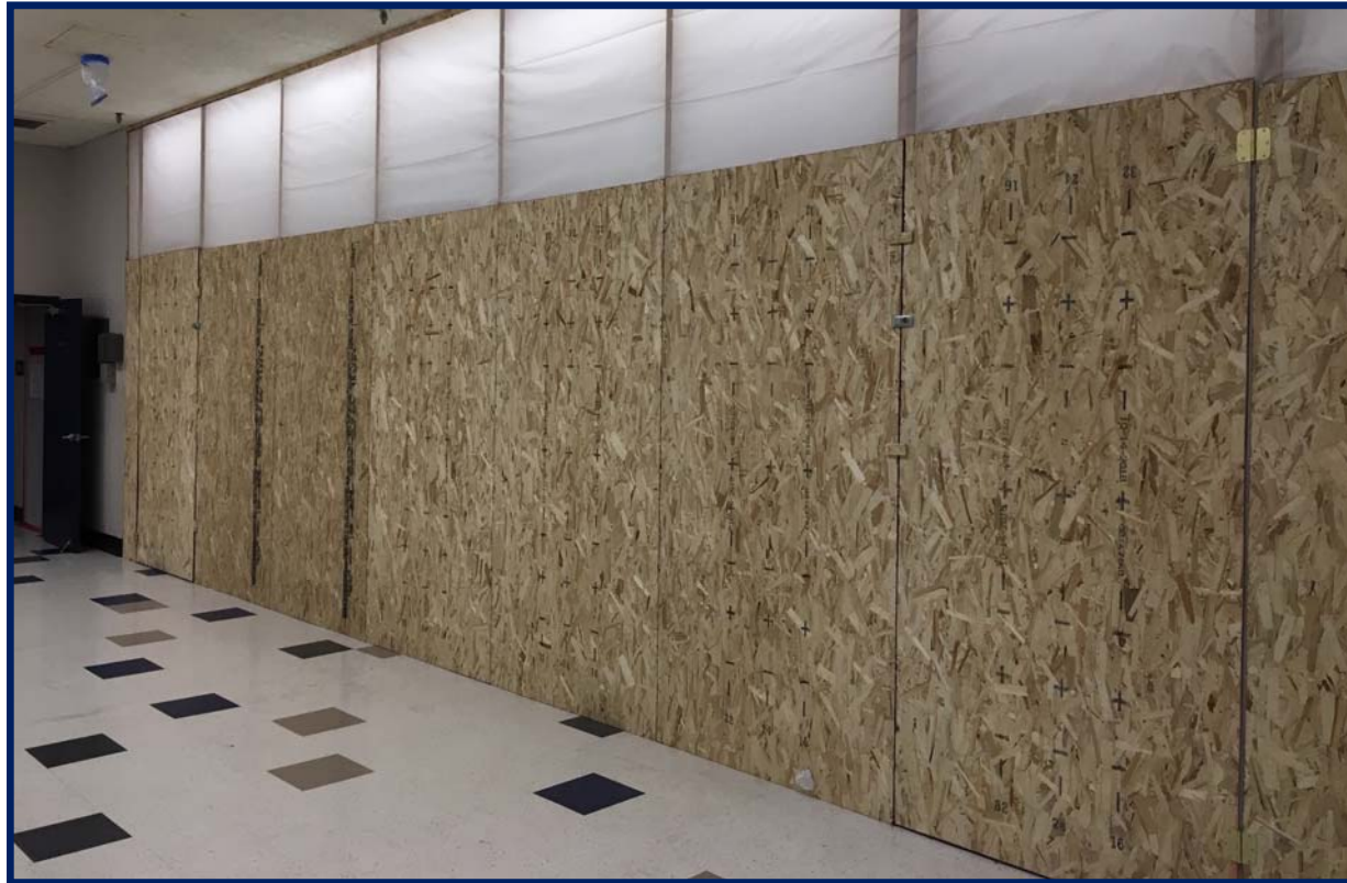
Cherrywood FIS – Kitchen Area - March